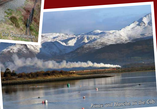
Prince and Blanche on the Cob

Leave it to us! It's pictures like these that are made possible by legacies like yours.