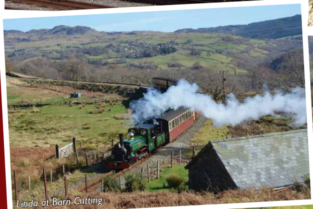
Linda at Barn Cutting