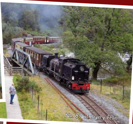
No. 87 at Bryn y Felin