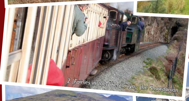
2 Fairlies in the Aberglaslyn - the Snowdonian